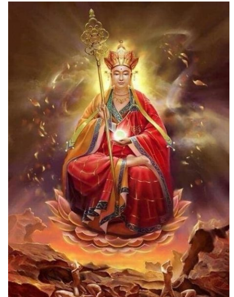
Ksitigarbha / He Saves suffering beings in Hell