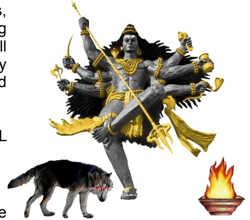
Lord Kala Bhairava / God of Time

Proper ceremony is done in Nepal with The Auspicious Offerings and 1000 Lights.