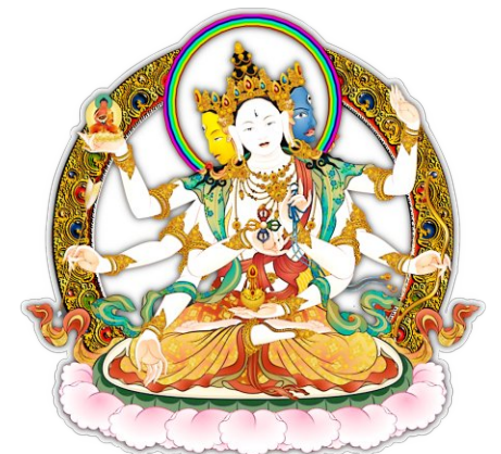
Goddess Namgyalma Solves all problems